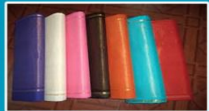
MANGALAGIRI HAND WEAVES